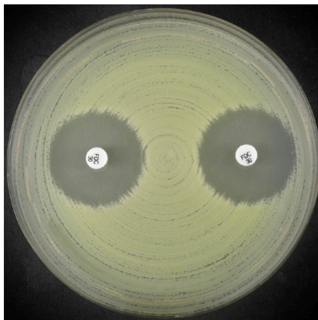
Cefiderocol disc 30 µg