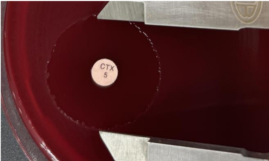
Example 1: Clostridium perfringens

Measure zone diameters to the nearest millimetre with a ruler or a calliper.