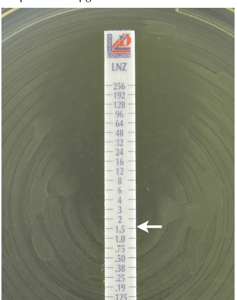
Example 3: E. faecalis, Linezolid MIC = 1.5 \mu g/mL, reported as 2 \mu g/mL