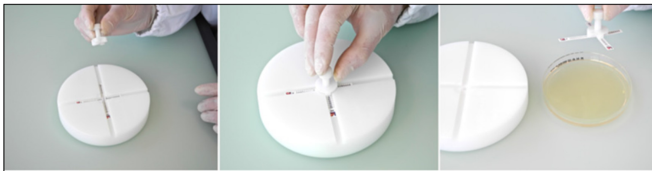
Fig. 1. MTS™ synergy applicator platform plus MTS antibiotic strips [19].

An MTS of fosfomycin was placed with tweezers on to the MTS synergy applicator platform, such that the MIC value for fosfomycin (tested alone) was positioned at the base intersection (see Fig. 1 below). An MTS of antibiotic 'B' (the partner antibiotic) was then carefully placed on to the MTS synergy applicator platform, such that the MIC value of antibiotic 'B' was positioned at the base insertion at a 90° angle to the fosfomycin MTS in a 'cross' formation. The MTS synergy delivery tool was used to move the appropriately positioned MTS 'cross' onto an inoculated agar plate. The MTS synergy delivery tool was then removed, ensuring MTS strips were pushed onto the agar surface with tweezers as required. Plates were then incubated for 24h. All synergy tests were photographed for future third-party reference/re-interpretation as needed.